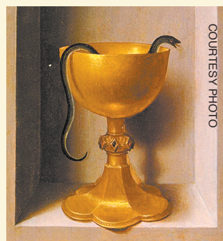
A painting by Hans Memling, circa 1475, shows poison in St. John's cup taking the shape of a snake.

In some countries, people once brought wine to church to be blessed on St. John's Day. Drink a toast to St. John today with your favorite non-poisonous beverage.