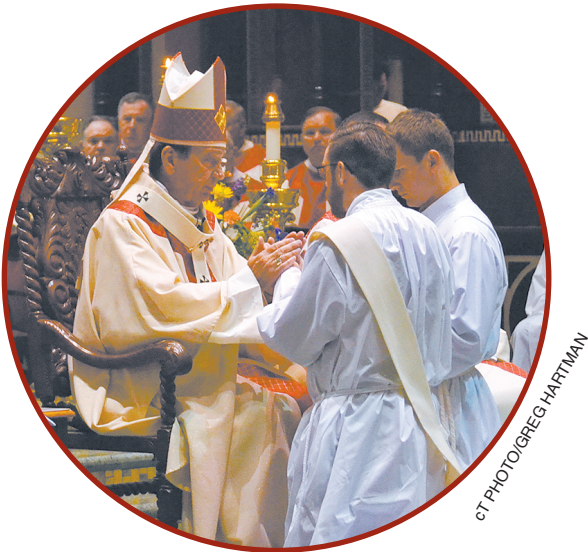
Ordination Mass: 11 a.m., May 19